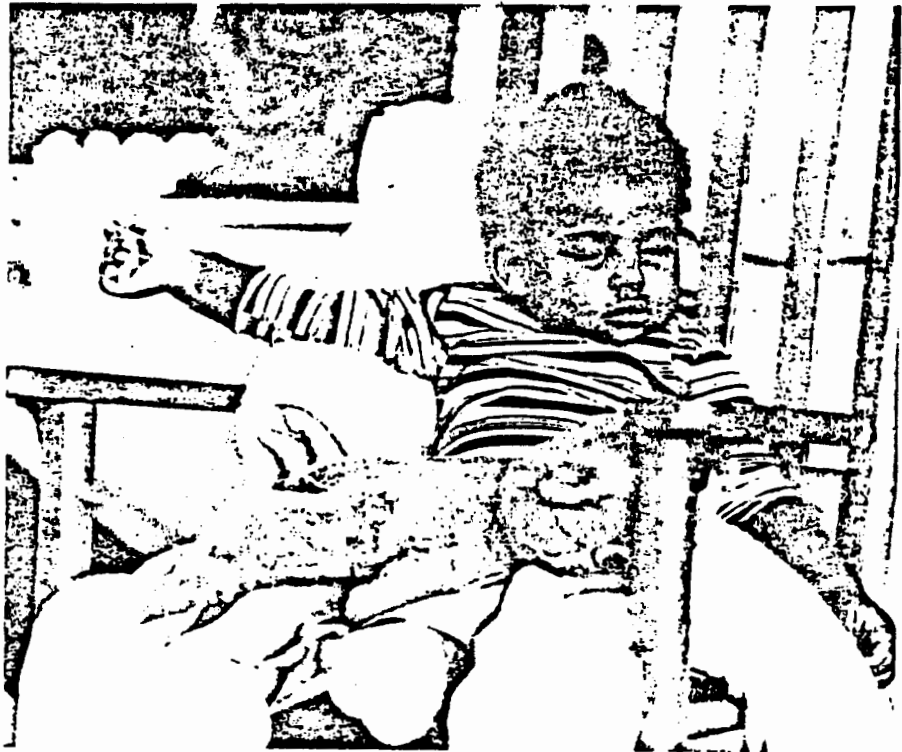
A child gets the rest she needs while her mother takes classes at the Parent Child Development Center.