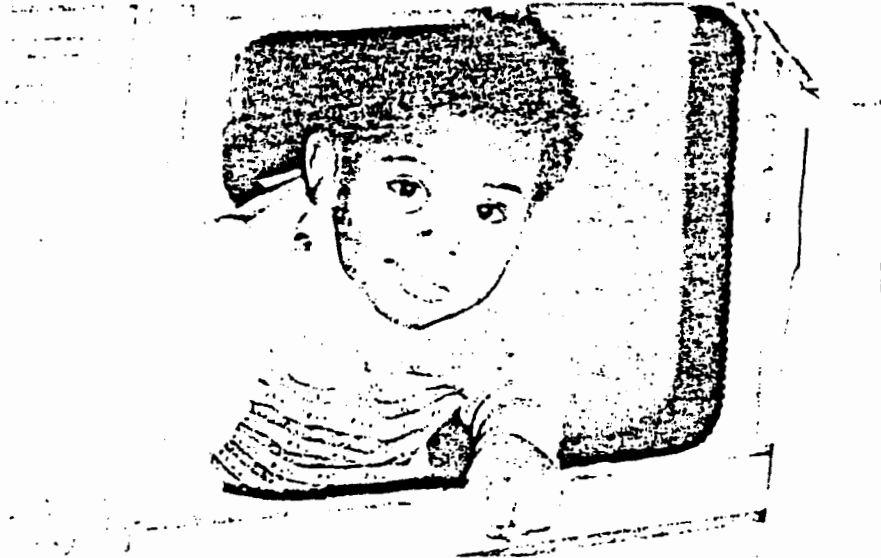
Nursery school activities for children.

small part of the programming and make it into a major emphasis for those clients at risk for child abuse and neglect. It allowed the PCDC to further tailor the program to the individual needs of the parents, many of whom were referred from social services or juvenile court.